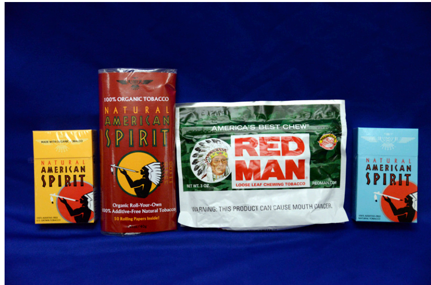
FIGURE 2—Examples of Indian Images on Tobacco Products

Although the tobacco industry supports sovereignty, at the same time they show no reluctance in exploiting our culture to sell destructive products, leaving the world with a distorted image of who we are as people. American Indian tradition is not to sell a sacred plant or use it to generate profits. The tobacco industry uses images such as war bonnets and pipes to sell products and perpetuate stereotypes (Figure 2). 43 Some tribal traditions prohibit images of spiritual items, yet we have no control of outsiders who use our images. These tobacco industry practices