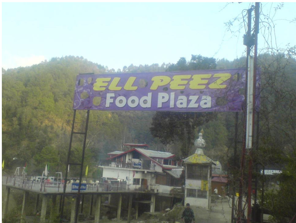
Hotel Peez after Notice by the Health Deptt.

HOOKA BAR Closed in Kandaghat Distt Solan HP. The same was noticed in the month of Dec 2011 and a notice was served to the owner to close the Hooka Bar with in a week's time .