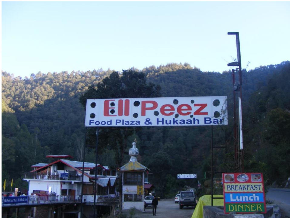
Hotel Peez with Hooka Bar (Before Notice)